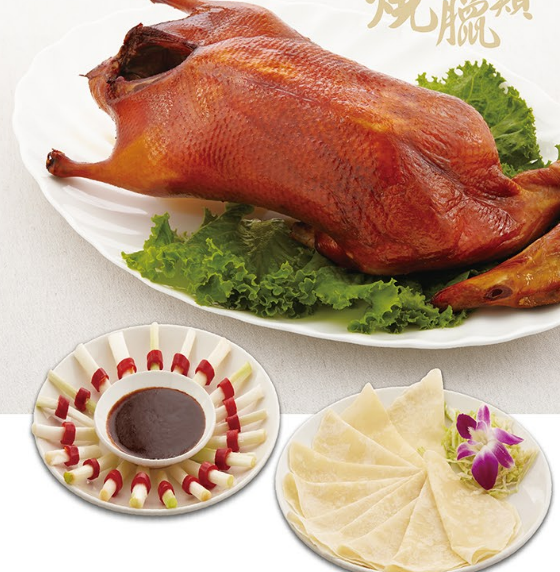
北平片皮鴨 NTS 1200 Peking Duck 附：手工餅皮、特製醬料 (including thin flat pancake and special sauce)