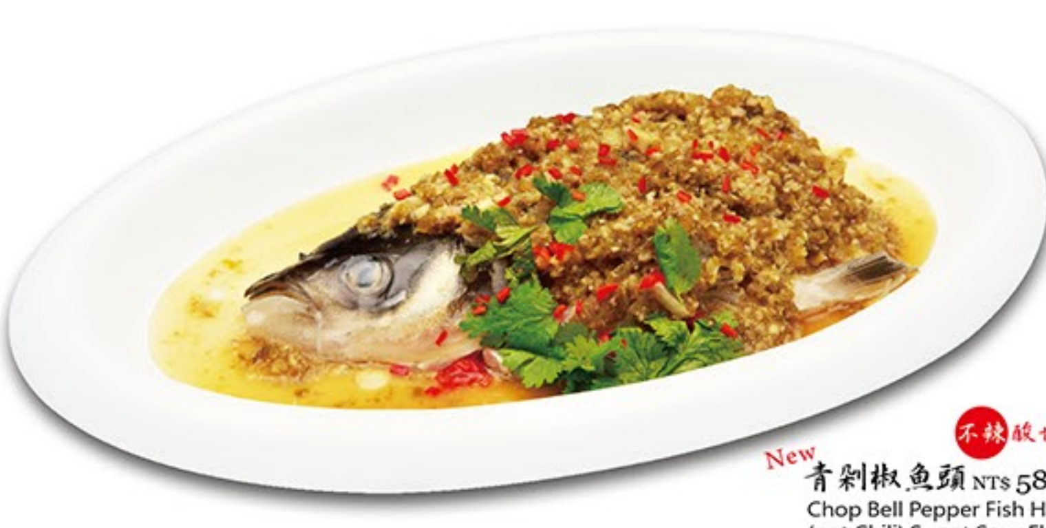
青刺椒魚頭 NTS 580 Chop Bell Pepper Fish Head (not Chili) Sweet Sour Flavored