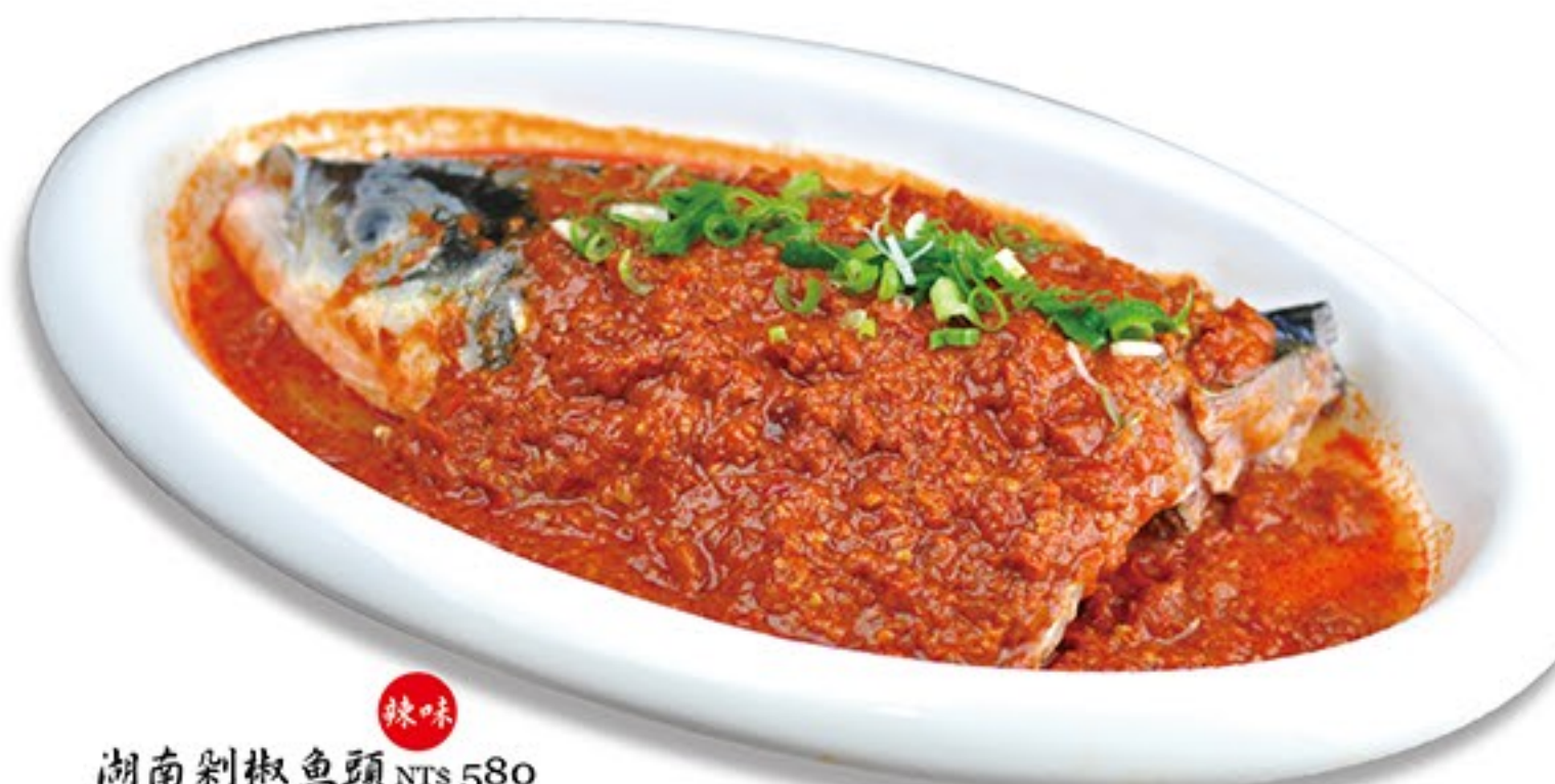
湖南刺椒魚頭 NTS 580 Hunan Style Chop Bell Pepper Fish Head (Chili Taste)

該菜以大魚魚頭，輔以湖南特色調味料刺椒，一同蒸點即可。刺椒味甜辣，偏鹹鮮，尤以湖南湘潭所產最為出名，有辣味、咸甘口感兩種風味。